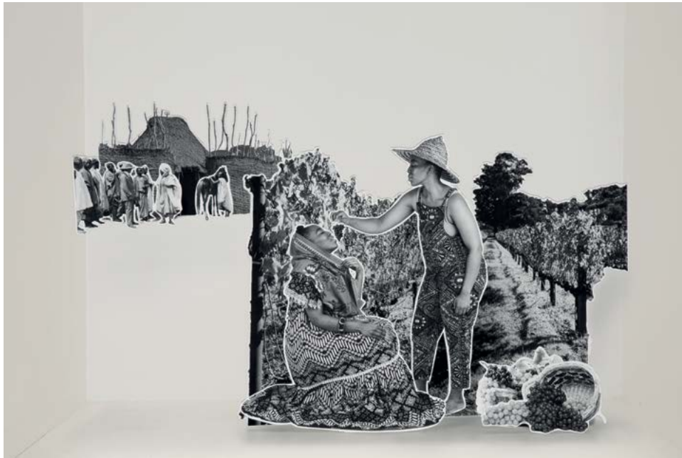
Time Needed to Hand over Power, 2023

Two Stories of (Hi)Stories, 2023, Photography, Installation.