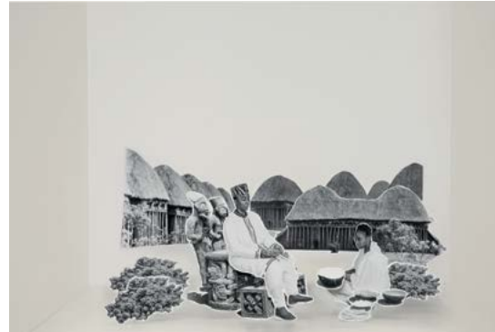
After Eating, Leave the Table, 2023 Inkjet print on cotton rag paper, 64 x 90 cm Edition of 5 + 2AP