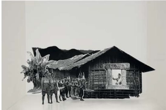
A Secret Return, 2023 Inkjet print on cotton rag paper, 64 x 90 cm Edition of 5 + 2AP

Two Stories of (Hi)Stories, 2023, Photography, Installation.