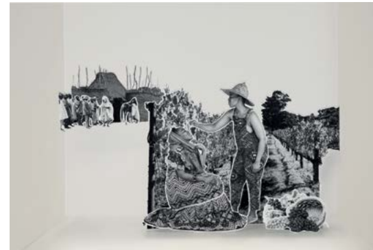
Time Needed to Hand over Power, 2023 Inkjet print on cotton rag paper, 64 x 90 cm Edition of 5 + 2AP