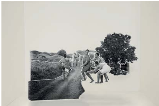
Set Foot on Stone of Country, 2023 Inkjet print on cotton rag paper, 64 x 90 cm Edition of 5 + 2AP